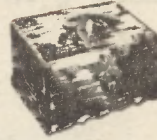
Jewel Box (Set No. 9)