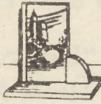
Picture Frame for Snapshots (Set No. 6)