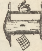
Recipe Shelf (Set No. 2)