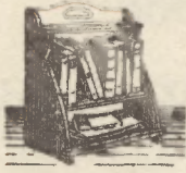
Book and Magazine Stand (Set No. 8)