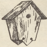
Bird House (Set No. 14)

STANLEY TOOLS EDUCATIONAL DEPARTMENT NEW BRITAIN, CONN.